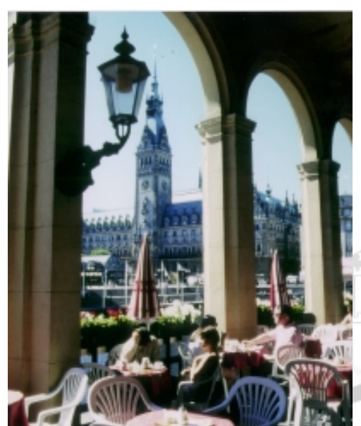
City Hall and Alster Arcades

On Wednesday afternoon no scientific sessions are scheduled. Symposium Delegates and Accompanying Persons are invited to select and book one of the three alternative tours described below.