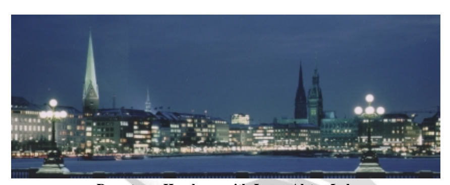
Downtown Hamburg with Inner Alster Lake